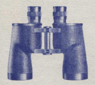
7 POWER, 50MM DAY AND NIGHT