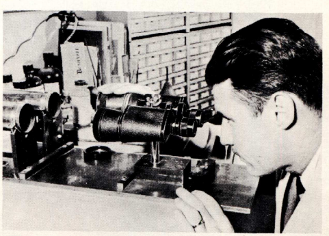
TRIPLE-TESTING. Each BUSHNELL Binocular is rigidly checked and rechecked with multiple quality controls and inspections. Finally it is given 3 complete laboratory tests, (a) optical (b) mechanical, and (c) functional, to guarantee lifelong, trouble-free use.

NEW! BINO-FOTOGRAPHY: Take beautiful long-range telephoto pictures, sharp and clear, with Bushnell Bineculars coupled to your camera. Easy. Inexpensive. Ask your dealer, or