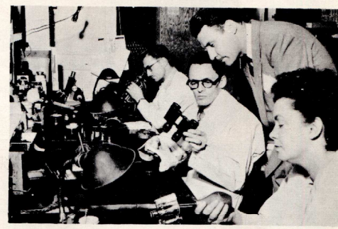
GENERAL INSPECTION UNIT. Inspectors and Technicians work as teams, rechecking the extreme precision employed in every phase of binocular construction. This fully assures that your BUSHNELL binocular will enable you to see clearly without eyestrain.