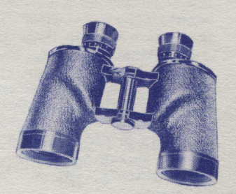
7 POWER, 35MM ALL PURPOSE