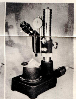
definition, angular and pyramidal deviations. Dial records ultra-precise tolerances.