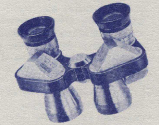
6 POWER, POCKET SIZE BROADFIELD